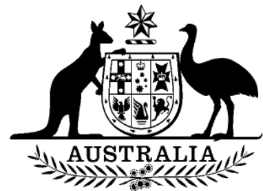
EW WHITLAM'S SEAL OF THE AUSTRALIAN GOVERNMENT

Reference re corporations / individuals/ royal prerogative / parliament / land ownership - Sir William Blackstone's Commentaries on the Laws of England